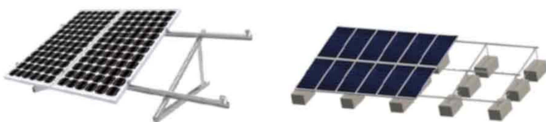
JS-R-02-2 Flat Roof Tripod PV mounting system

Jesfer design 3 types of products for flat roof mounting system ,single normal tripod support,adjustable tripod support and double tripod Support. You can have fixed or adjustable solution from 5-45 degrees.solar modules can be arranged with single or double row of landscape or portrait orientation.